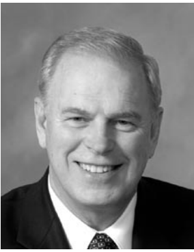
Ted Strickland, Ohio Governor