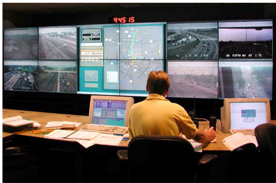
The wall of monitors – with cameras and a map displaying speed sensor information – at the City of Columbus and ODOT’s Traffic Management Center allows centralized supervision of traffic and posting of alerts to keep motorists informed.

During Phase II of the installation, 13 new signs will be placed along interstates 70, 71, 270, 670, State Route 315 and U.S. routes in the Columbus area. ODOT and the city of Columbus will add seven new ramp meters to regulate traffic on congested freeway segments. In addition, 41 new freeway cameras will be added to the 21 already used to monitor traffic. Motorists will be able to use the Internet