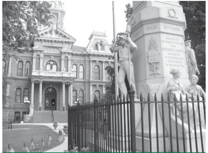
The Guernsey County Courthouse along the Historical National Road in Cambridge, Ohio.

The Rankin House and Parker House, located in Ripley, provides a historic perspective of Ohio’s contribution and significance to the Underground Railroad movement. Historic Marietta, the oldest city in Ohio, is a true river community which offers guests of the city dramatic